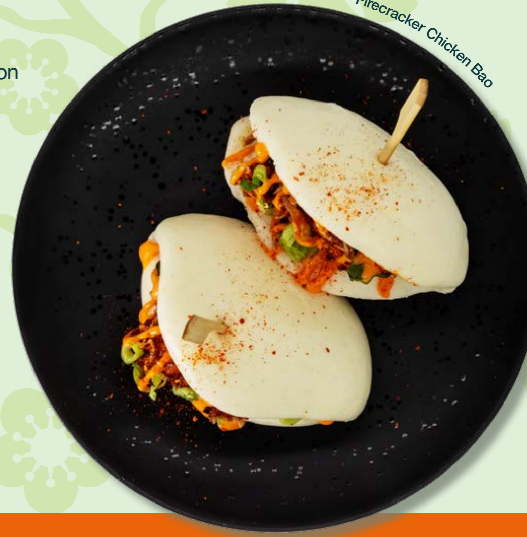
Firecracker Chicken Bao

Optional staffed service. Delivery fee applies.