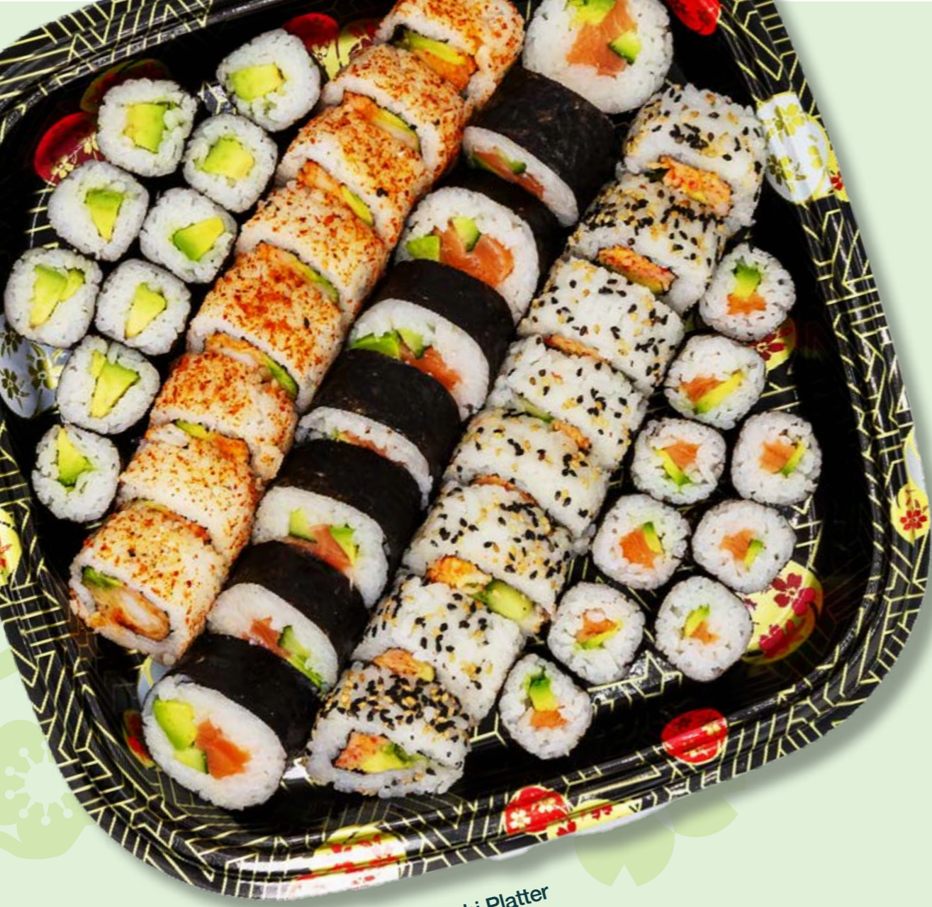
Mixed Sushi Platter