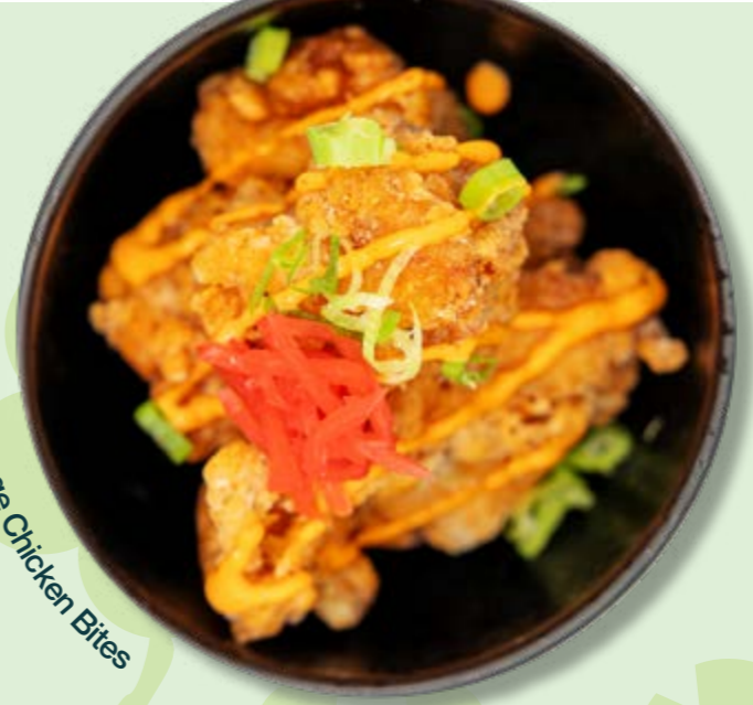
Karaage Chicken Bites